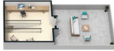
ROOF TOP FLOOR LEVEL