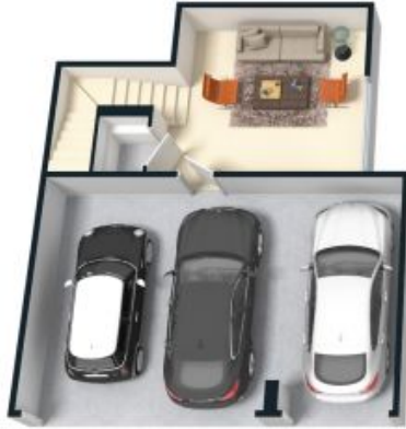
BASEMENT FLOOR LEVEL