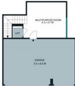
BASEMENT FLOOR LEVEL