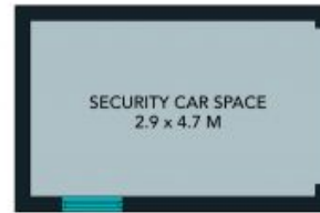
BASEMENT LEVEL (NOT IN POSITION)