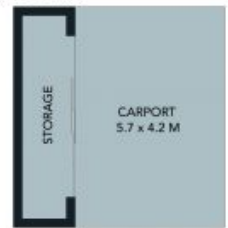
(NOT IN POSITION)