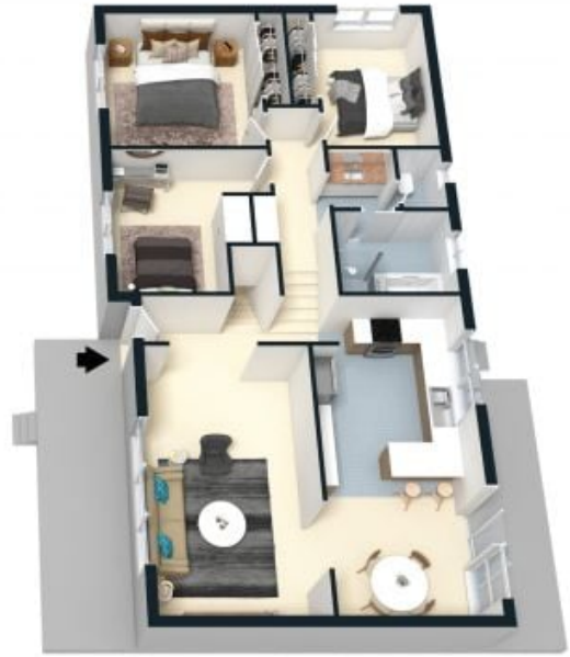
Middle Level/Upper Level

The floor plan is not to scale; measurements are indicative and in meters. All features included in this 3D plan are for inspiration purposes only. This is not an exact replica of the property or the position of exterior elements. Plans should not be relied on. Interested parties should make and rely on their own enquiries.