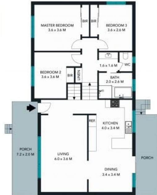
Middle Level/Upper Level