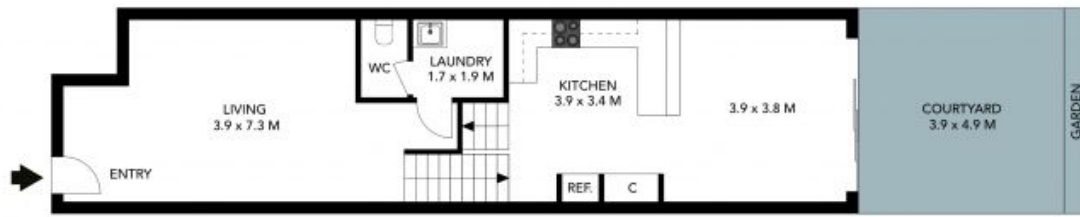
GROUND FLOOR/LEVEL 1