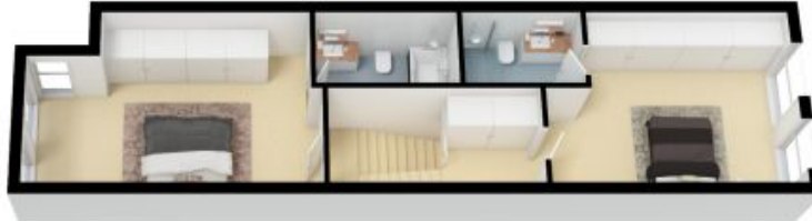
LEVEL 2 /LEVEL 3

The floor plan is not to scale, measurements are indicative and in metres. All features included in this 3D plan are for inspiration purposes only. This is not an exact replica of the property or the position of exterior elements. Plans should not be relied on. Interested parties should make and rely on their own enquiries.