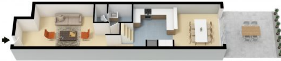
GROUND FLOOR/LEVEL 1