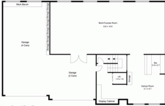
Lower Ground Floor/Basement