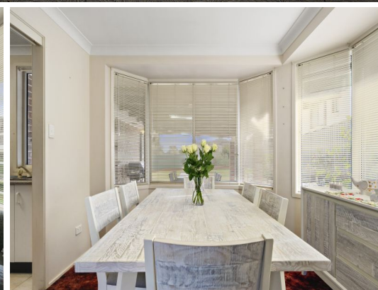
3 Cottage Corner Court Lake Haven, NSW