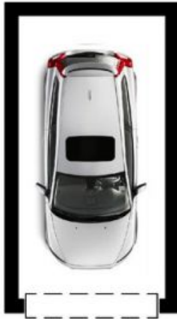
Garage 3.0 x 6.0m