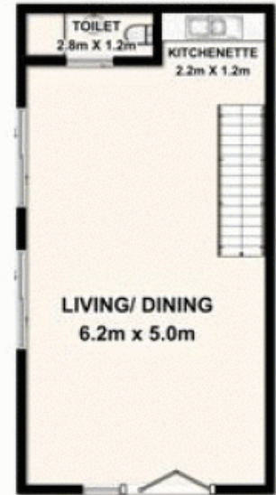
GRANNY FLAT (GROUND FLOOR)

DISCLAIMER: THIS PLAN IS FOR ILLUSTRATIVE PURPOSES ONLY. DIMENSIONS ARE APPROXIMATE AND IT DOES NOT CONSTITUTE PART OF ANY LEGAL DOCUMENT.