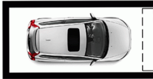
Garage 2.7 x 6.0m