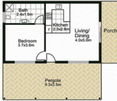
GRANNY FLAT FLOOR PLAN