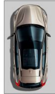
Secure Carspace 3.2x5.6m