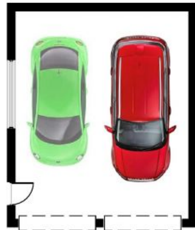
Garage 5.8 x 7.2m