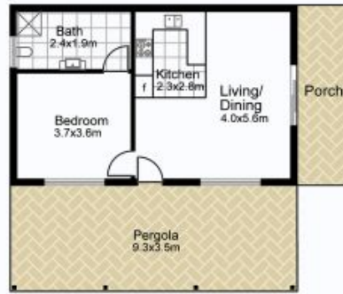
GRANNY FLAT FLOOR PLAN