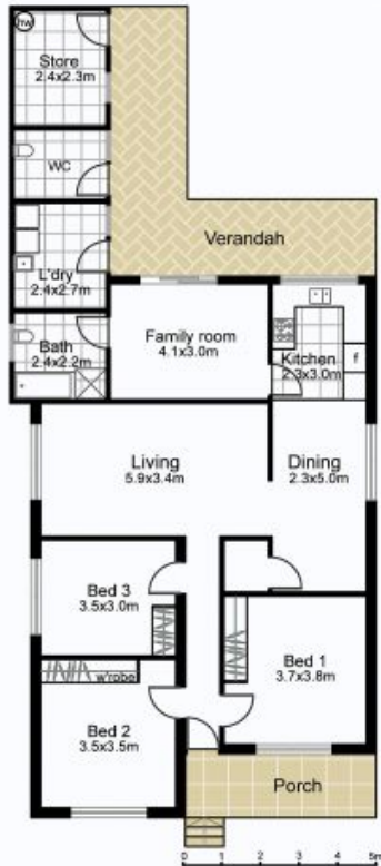
MAIN HOUSE FLOOR PLAN