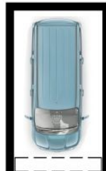
Garage 3.2 x 5.5m