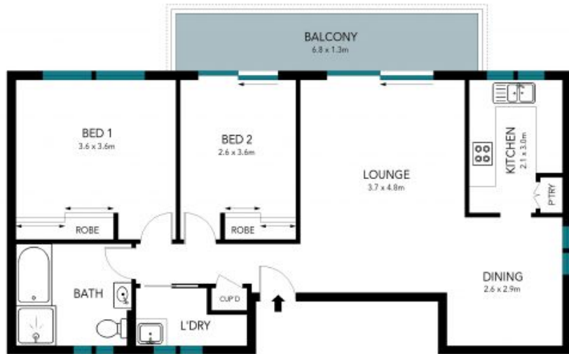
ELEVATED GROUND FLOOR

The floor plan is not to scale; measurements are indicative and in metres. Exterior elements are not in position. Plans should not be relied on. Interested parties should make and rely on their own enquiries.