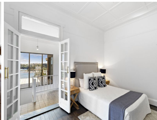
16 Magarra Place Seaforth, NSW 5 2