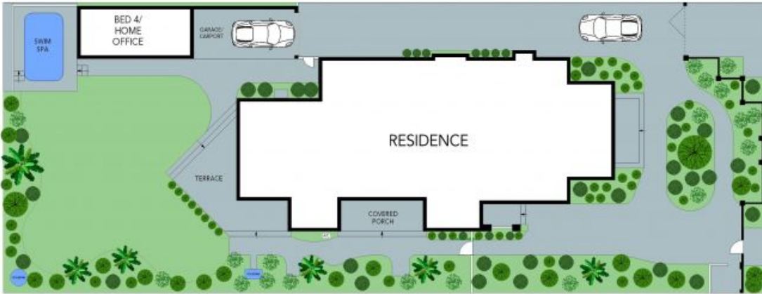
SITE PLAN (SCALE APPROXIMATE)