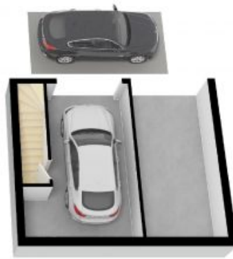
UNIT 4 BASEMENT FLOOR

The floor plan is not to scale, measurements are indicative and in metres. All features included in this 3D plan are for inspiration purposes only. This is not an exact replica of the property or the position of exterior elements. Plans should not be relied on. Interested parties should make and rely on their own enquiries.