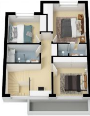
UNIT 4 FIRST FLOOR