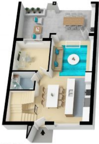
UNIT 4 GROUND FLOOR