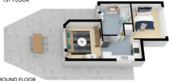
GROUND FLOOR STUDIO APARTMENT