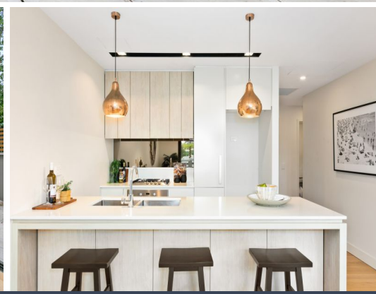
LG02/1-5 Chapman Avenue Beecroft, NSW 2 2 1