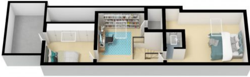
UPPER LEVEL - LOFT