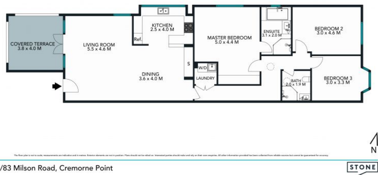
3/83 Milson Road, Cremorne Point