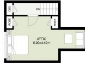
ATTIC FLOOR PLAN

This floor plan including furniture, fixture measurements and dimensions are approximate and for illustrative purposes only. Boxbrownie.com gives no guarantee, warranty or representation as to the accuracy and layout. All enquiries must be directed to the agent, vendor or party representing this floor plan.