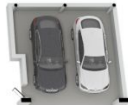
OPEN STREET LEVEL