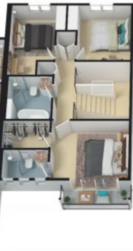
FIRST FLOOR (UNIT 1)