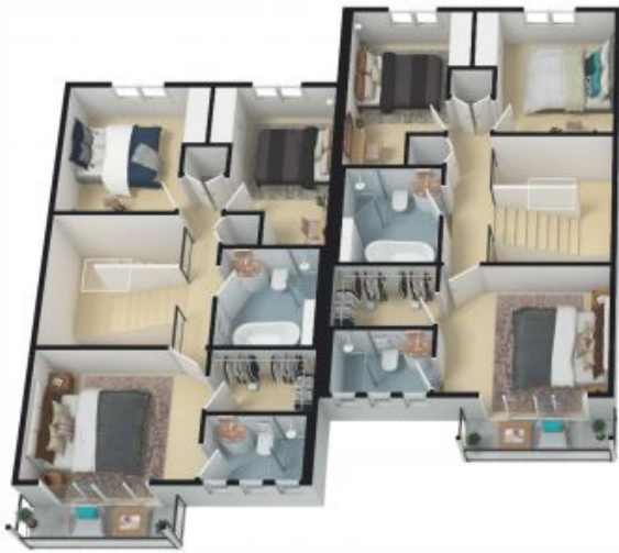
FIRST FLOOR (UNIT 2)