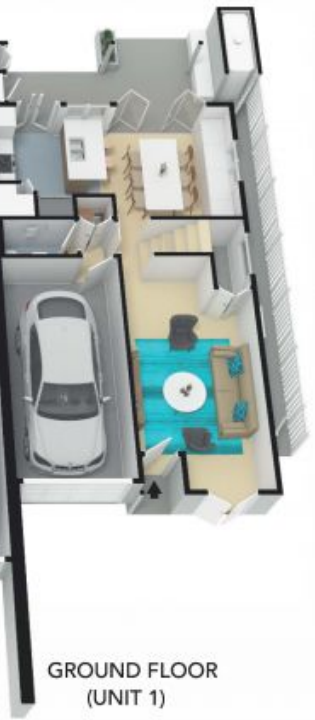
GROUND FLOOR (UNIT 1)

The floor plan is not to scale, measurements are indicative and in metres. All features included in this 3D plan are for inspiration purposes only. This is not an exact replica of the property or the position of exterior elements. Plans should not be relied on. Interested parties should make and rely on their own enquiries.