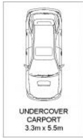
UNDERCOVER CARPORT 3.3m x 5.5m