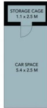
(NOT IN POSITION) (NOT IN POSITION)