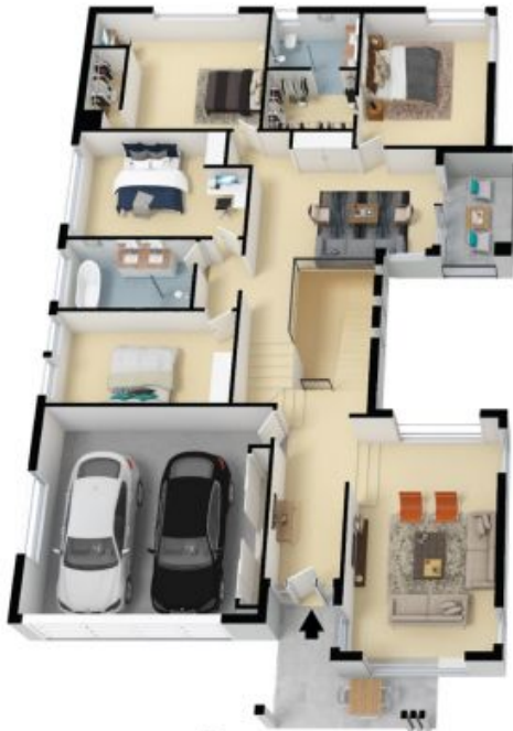
Ground Floor/1st Floor