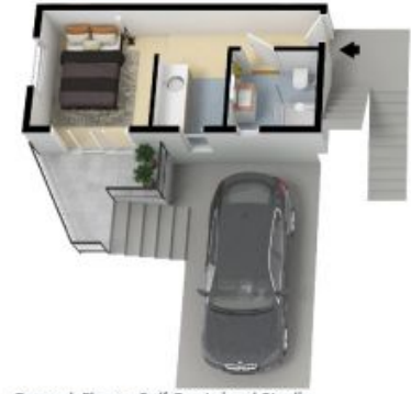
Ground Floor - Self Contained Studio