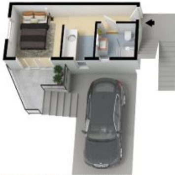
Ground Floor - Self Contained Studio