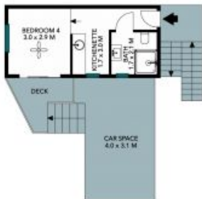
Ground Floor - Self Contained Studio