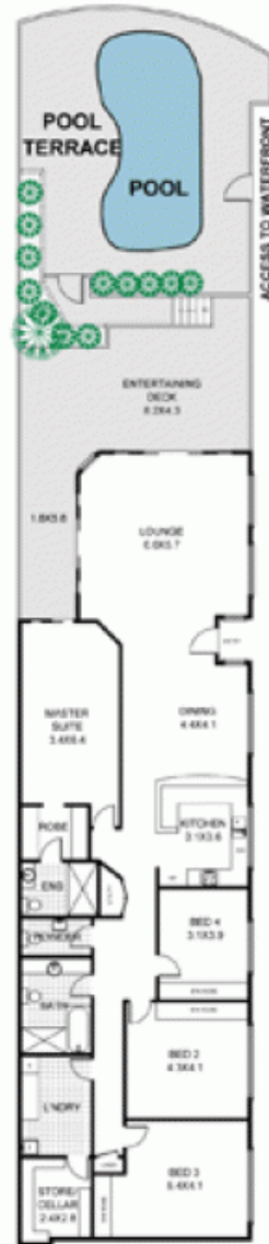
GENERAL PLAN (NOT TO SAME SCALE)