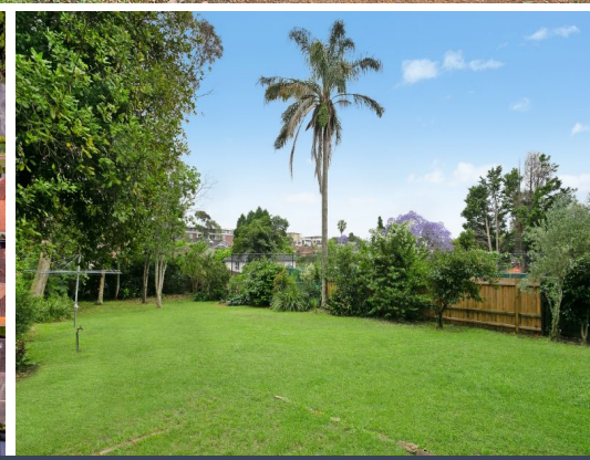
12 Middle Harbour Road Lindfield, NSW 4 3 2