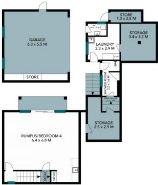
Lower Ground Level

Internal Living: 229 sqm External Living: 34 sqm Total Living Area: 263 sqm