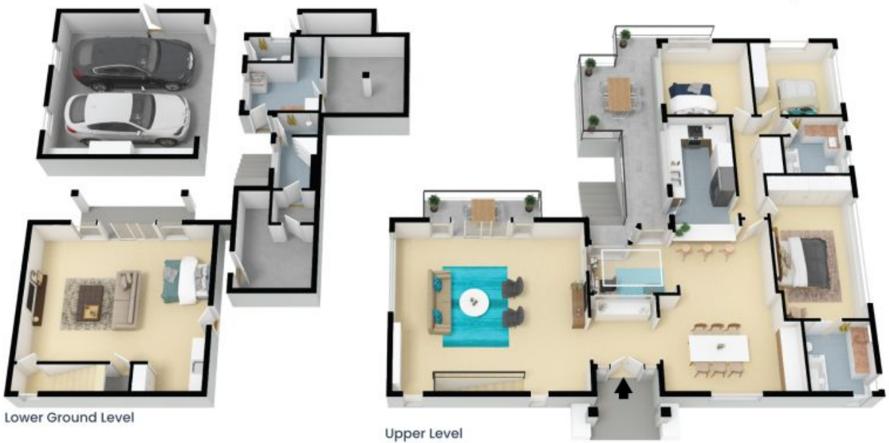
Lower Ground Level