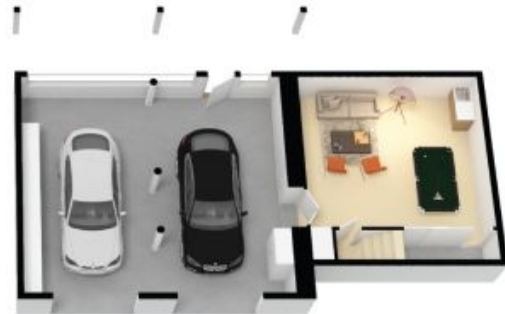
Lower Ground Level

Internal Living: 271 sqm External Living: 42 sqm Total Living Area: 313 sqm