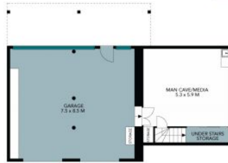
Lower Ground Level