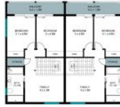
UNIT 2 UNIT 4