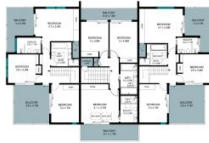
UNIT 1 UNIT 3 UNIT 5