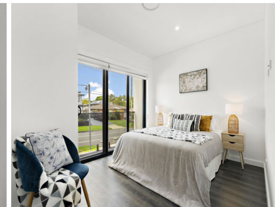
130a Whalans Road Greystanes, NSW 4 [bed icon] 3 [bath icon] 1 [car icon]