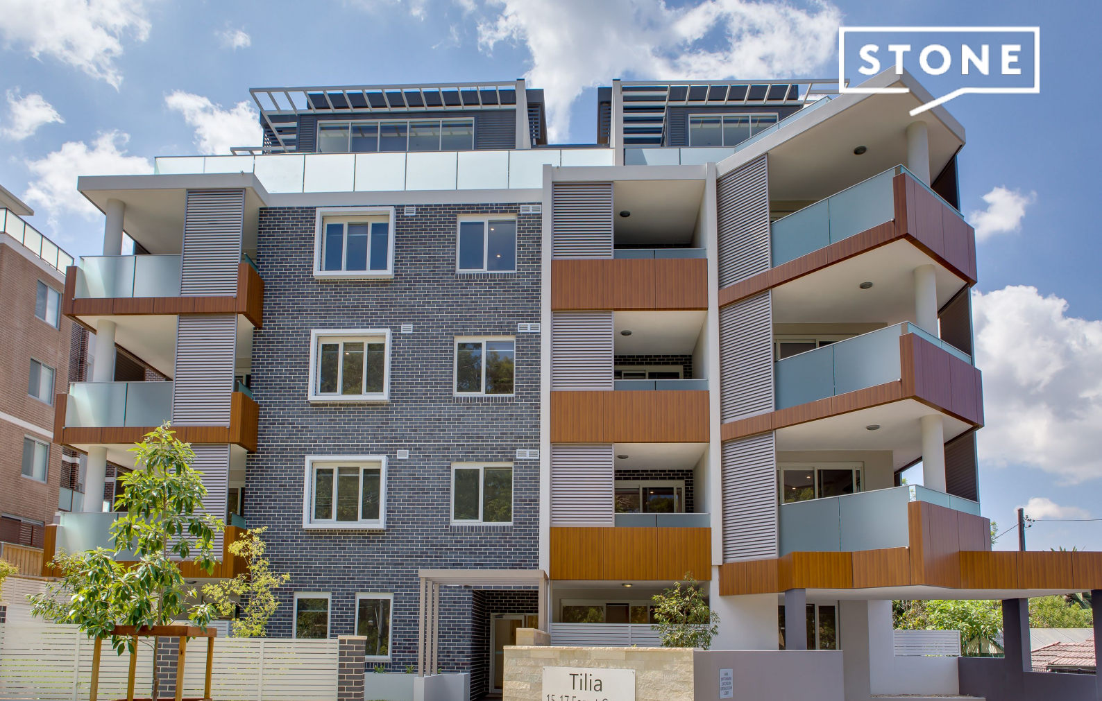
Tilia 15-17 Forest G