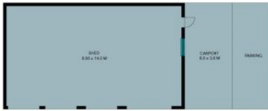
NOT IN POSITION