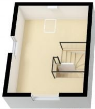
Second Level (Attic)