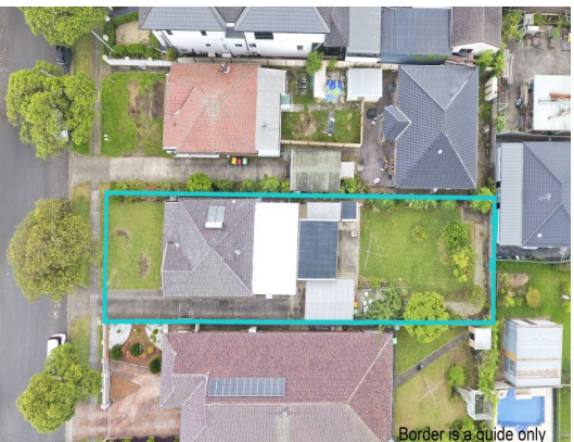
Border is a guide only