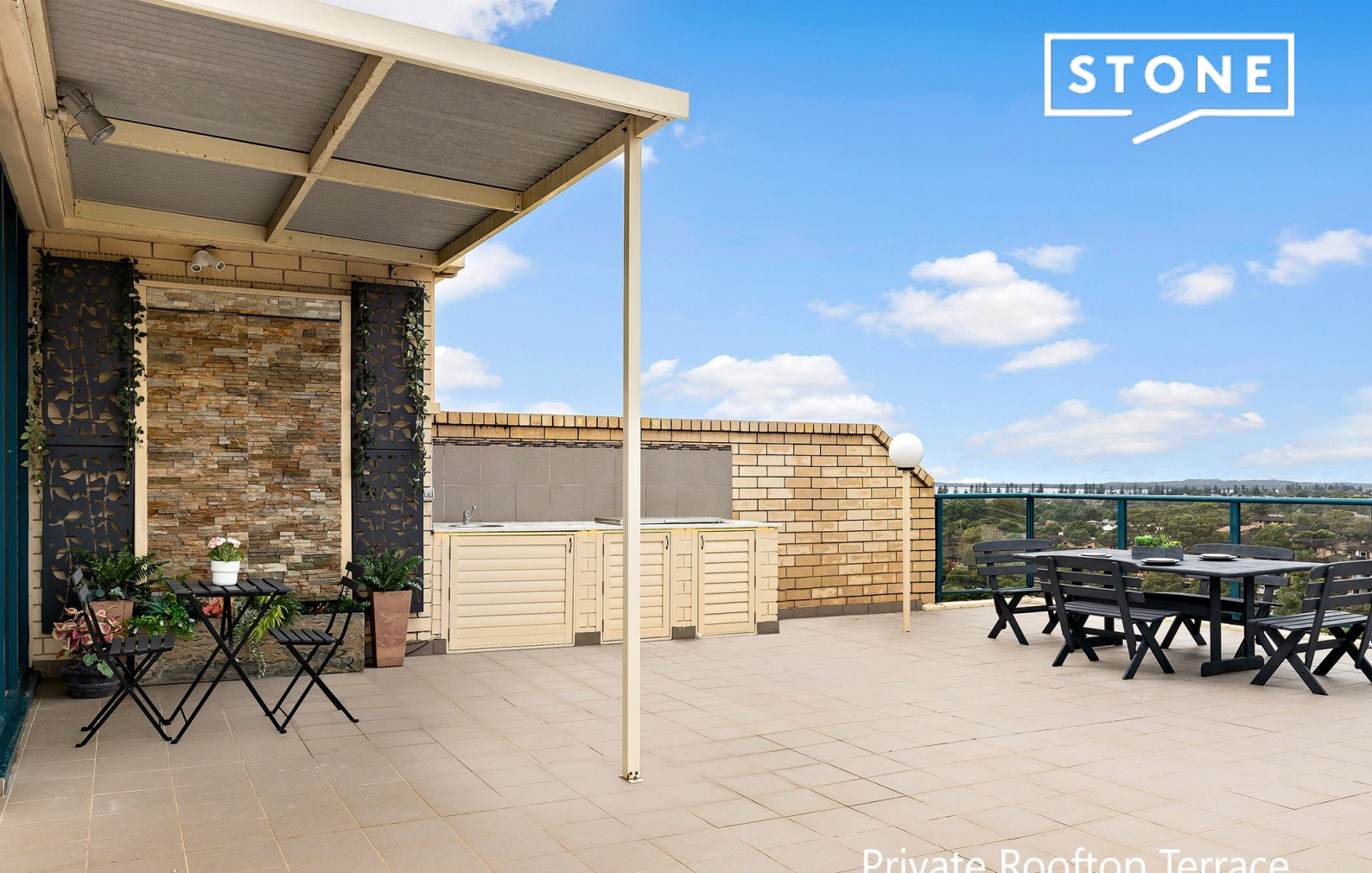
Private Rooftop Terrace