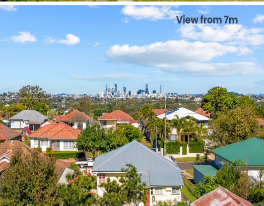
View from 7m