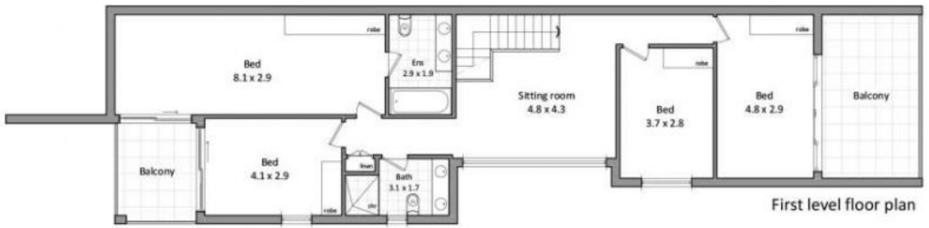
First level floor plan