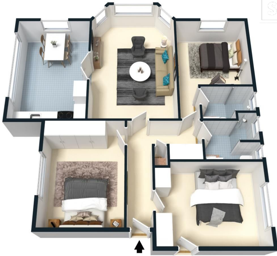
The floor plan is not to scale; measurements are indicative and in metres. All features included in this 3D plan are for inspiration purposes only. This is not an exact replica of the property or the position of exterior elements. Plans should not be relied on. Interested parties should make and rely on their own enquiries.