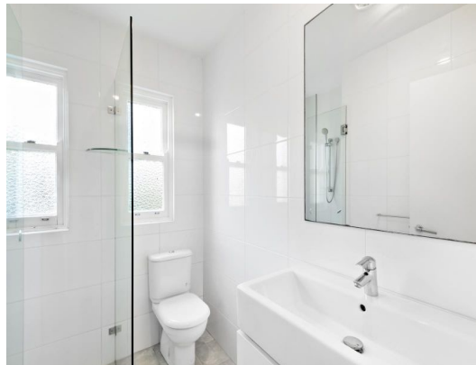
Produced by DMM007