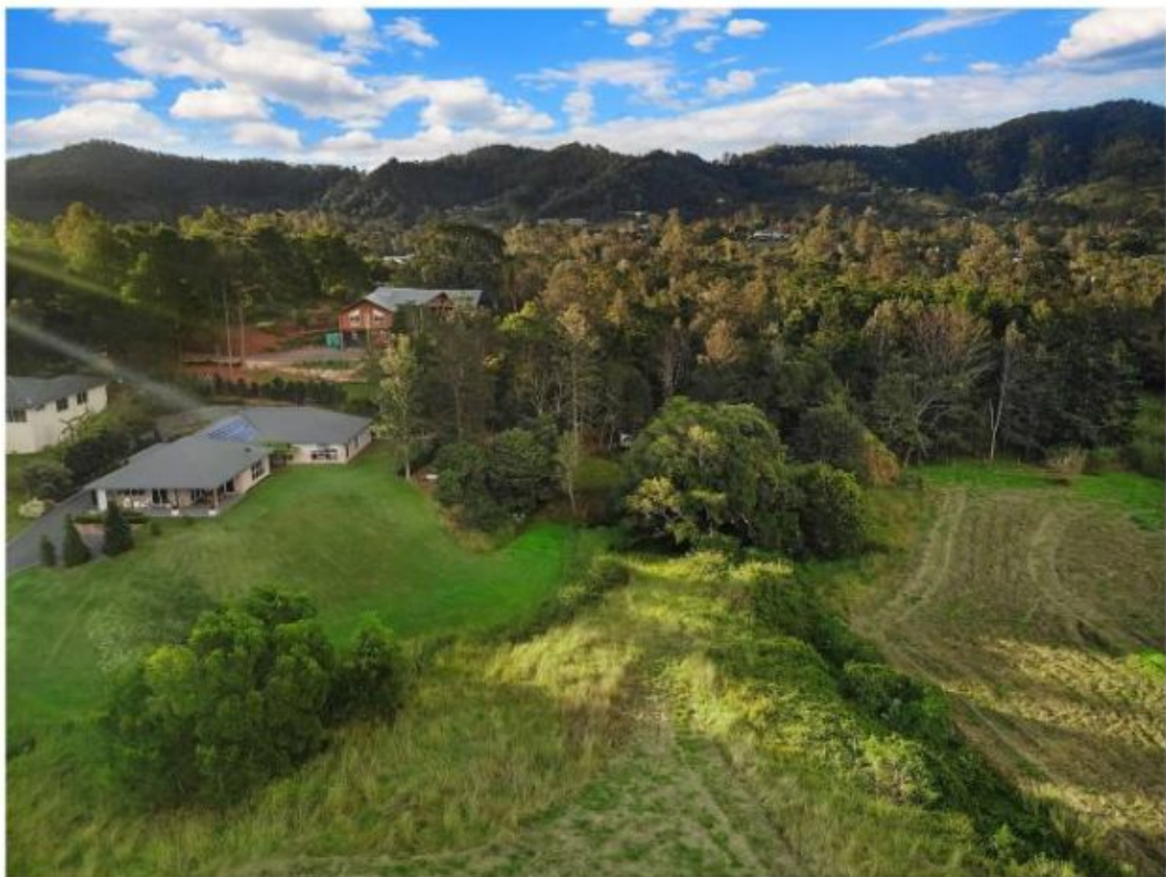
13 Tralisa Court, Samford Valley

Whilst every attempt has been made to ensure accuracy, floor plans are representative and should be used as a guide only