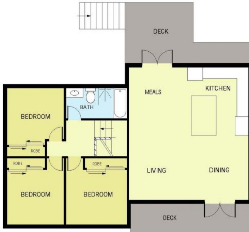
TOP & MID FLOOR