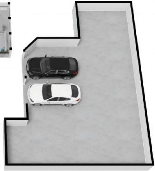
Under Ground Floor