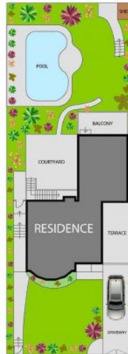
General Site Plan (Not to Same Scale)