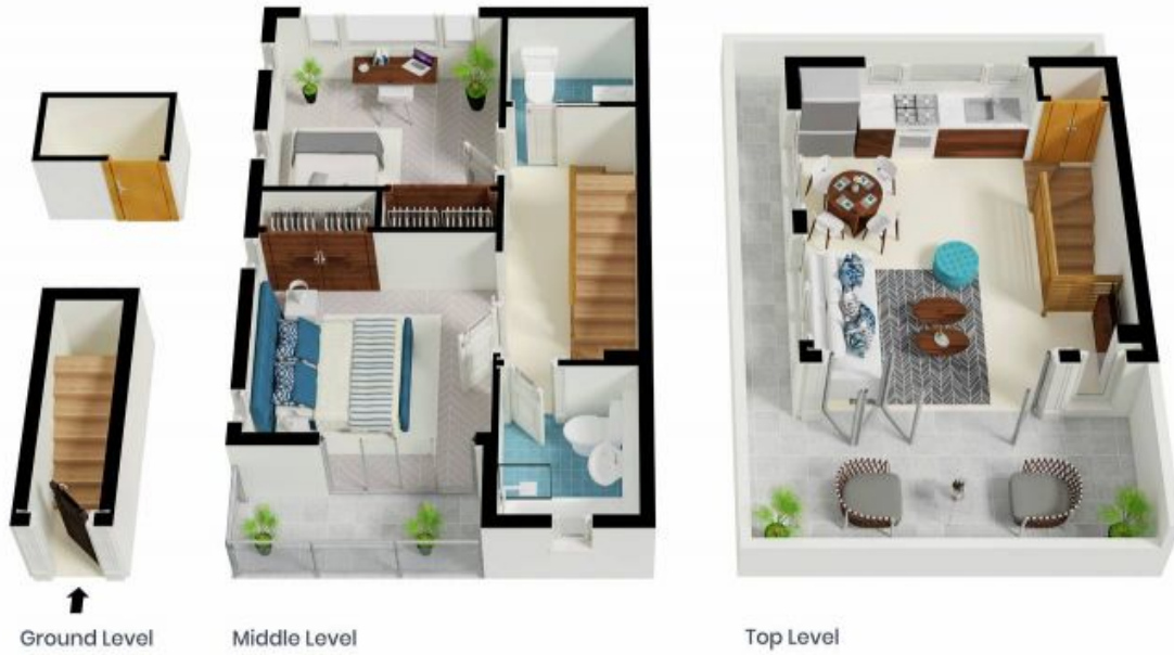
↑ Ground Level